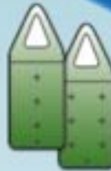
4 Litre Pouch with Handle