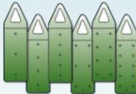
6 Litre Pouch with Handle