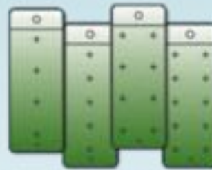
6 Litre Pouch with Punch Only - Flat Top