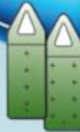
5 Litre Pouch with Handle