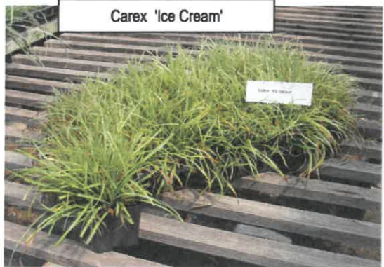
Carex 'Ice Cream'