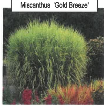
Miscanthus 'Gold Breeze'