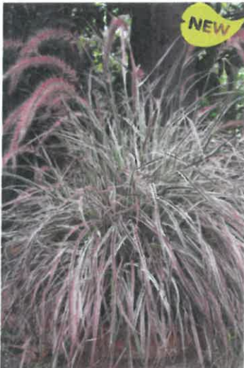
Pennisetum 'Cherry Sparkler'