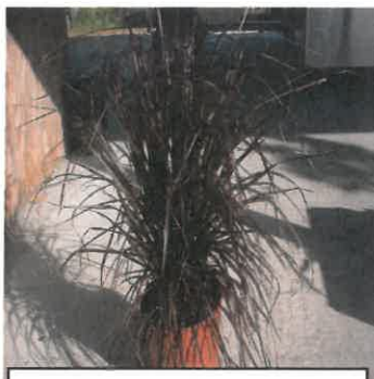
288 cell planted in 3 gallon in Central Florida ~ Planted 10/6/06 Pictured 12/8/06 (9 Weeks)