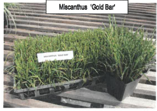
Miscanthus 'Gold Bar'